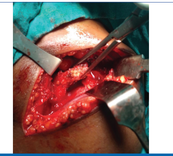
[Table/Fig-1]: Coracoid osteotomy done and conjoint tendon mobilised.

Patients were placed in supine position on the operating table with sandbag placed under the operative shoulder. General anaesthesia was given with endotracheal tube placed on the opposite side. After antiseptic preparation a standard 10 cm deltopectoral incision was made starting proximal to the tip of coracoid process extending distally along deltopectoral groove. Cephalic vein was identified and retracted along with deltoid muscle laterally and Pectoralis major was retracted medially exposing the tip of coracoid process with its attached muscles. Pectoralis minor muscle was erased from the coracoid process medially leaving behind coracobrachialis and short head of biceps attached to coracoid process. A hole was predrilled and tapped from anterior part of coracoid process along the axis of coracoid. Coracoid process was osteotomised along with attached coracobrachialis and short head of biceps muscle at a point 2 cm from the tip of coracoid process [Table/Fig-1]. The conjoint tendon was elevated till the lower border of subscapularis muscle taking care to protect musculocutaneous nerve and anterior circumflex vessels. Shoulder was rotated externally and Subscapularis muscle was identified and split along fibres at upper two-third and lower one-third junction of its width and retracted superiorly and inferiorly exposing the shoulder joint capsule [Table/Fig-2]. Joint capsule was incised