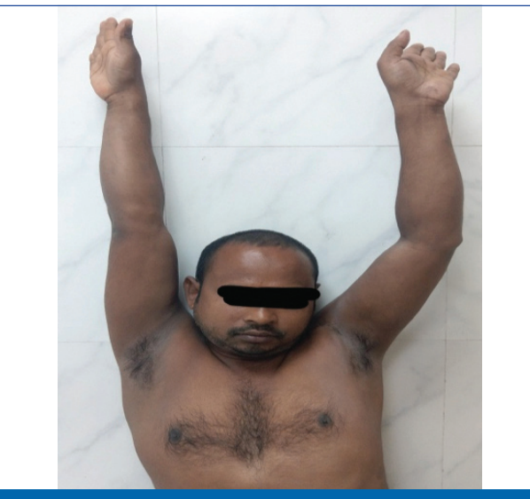
[Table/Fig-8]: Showing forward flexion at three months